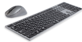
Dell Premier Multi-Device Wireless Keyboard and Mouse - KM7321W

Elevate your productivity on this innovative 27-inch QHD Hub monitor with a wide color coverage including DCI-P3. Features ComfortView Plus an always-on built-in low blue light screen, USB-C with up to 90W power delivery, and RJ45 connectivity.