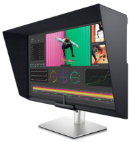
Dell UltraSharp 32 HDR PremierColor Monitor - UP3221Q

Create phenomenal 4K HDR content on the world's first professional monitor with 2K mini-LED direct backlit dimming zones.*