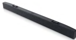
Dell Slim Soundbar - SB521A

An immersive 34" WQHD curved monitor with wide color coverage and extensive connectivity including RJ45, USB-C® and quick-access front ports.