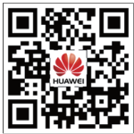
Huawei Enterprise APP

To learn more about Huawei storage, please contact your local Huawei office or visit the Huawei Enterprise website: http://e.huawei.com .